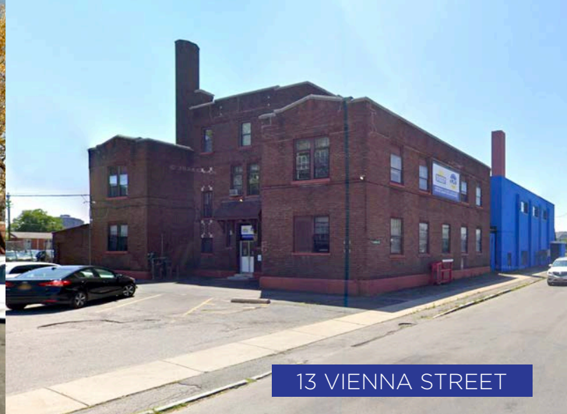
13 VIENNA STREET