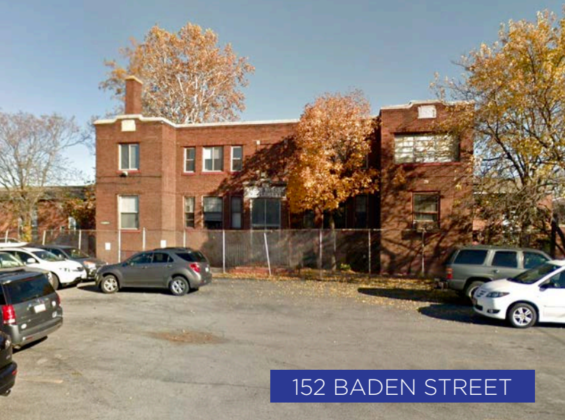
152 BADEN STREET